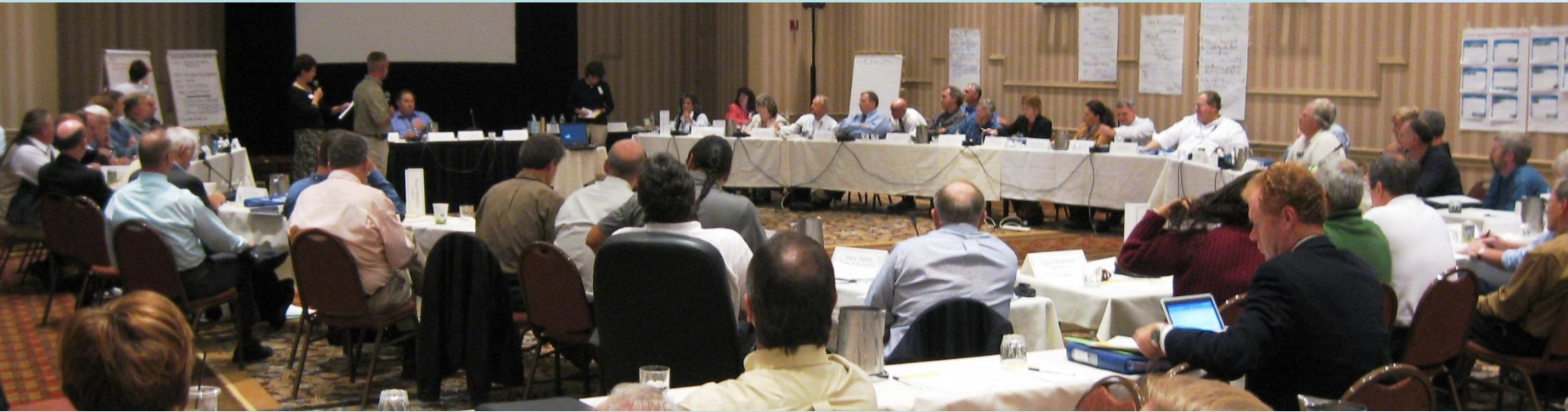
Table for 68?